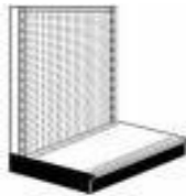
Dimensions: 4' wide x 6' high x 16" base