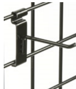
GRID WALL HOOK