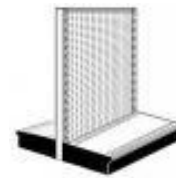
Dimensions: 4' wide x 6' high x 32" base

Please indicate below where you would like your gondola(s) set up in your booth: