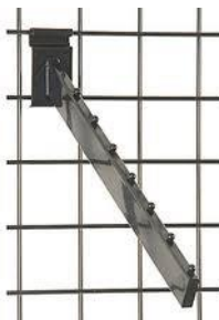
7-BALL WATERFALL HOOK